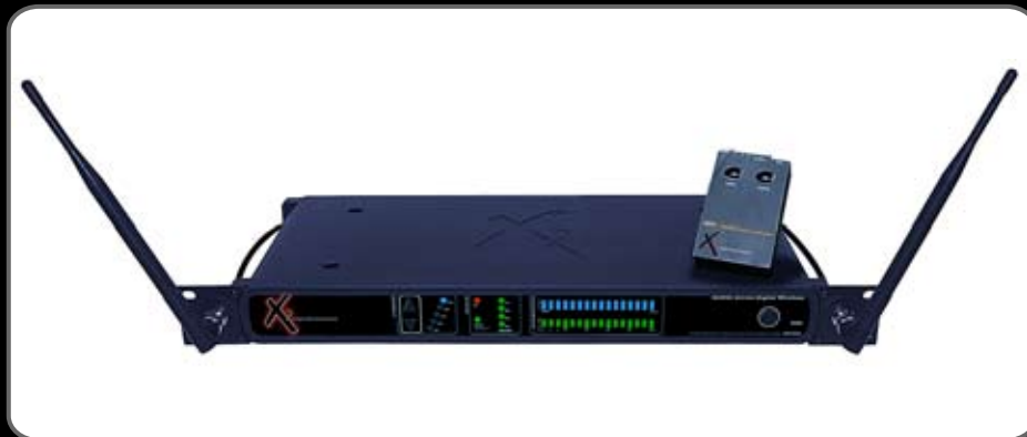
The freedom to perform with the confidence that every nuance will be heard and felt.

The XDR95 is a 24-bit digital wireless system purpose-built for live musical performances - from studio to stage, clubs to arenas. Made in the USA, the system features X2's Tru-Digital™ companderless digital format for the sound and feel of a direct wire connection.