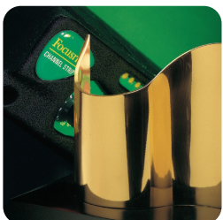
Pre-amplifier technology derived from the TEC award-winning Green Range