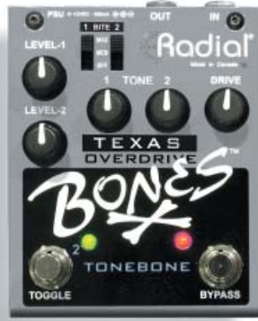
Texas Bones order # R800 7110

The Texas is a high performance overdrive pedal that delivers a range of tones as wide as the Dallas sky in a compact and easy to use format.