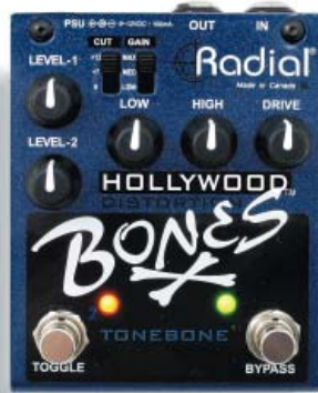
Hollywood Bones order # R800 7100

The Hollywood is a high performance distortion that delivers "American" style tones in a compact and easy to use format that's ready to rock and roll!