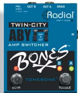
Twin-City Bones order # R800 7115

Bright, easy to see LEDs deliver on-stage switching cues so you know exactly what your amps are up to at all times. The Twin-City is a powerful AB/Y switcher that delivers all of the natural tone, punch and clarity without the inducing noise of any kind.