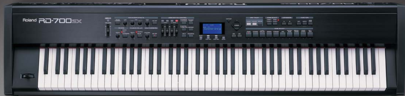
*Product pictured is a prototype model. Actual product appearance may be subject to change.