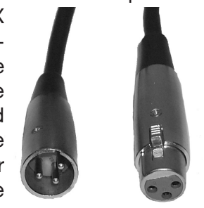
remember that DMX cable must be daisy chained and cannot be split.

the Mega GO Bar 50. Your unit and your DMX controller require a standard 3-pin XLR connector for data input and data output (Figure 1). We recommend Accu-Cable DMX cables. If you are making your own cables, be sure to use standard 110-120 Ohm shielded cable (This cable may be purchased at almost all pro lighting stores). Your cables should be made with a male and female XLR connector on either end of the cable. Also