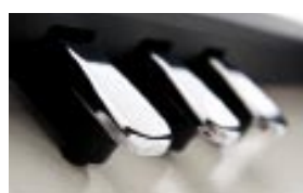
Luxurious metallic 3-pedal unit.