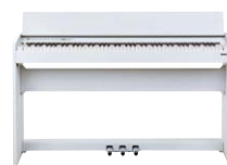
Cabinet variations (Satin Black and White).