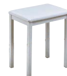
Options: Piano Benches (Satin Black, White).