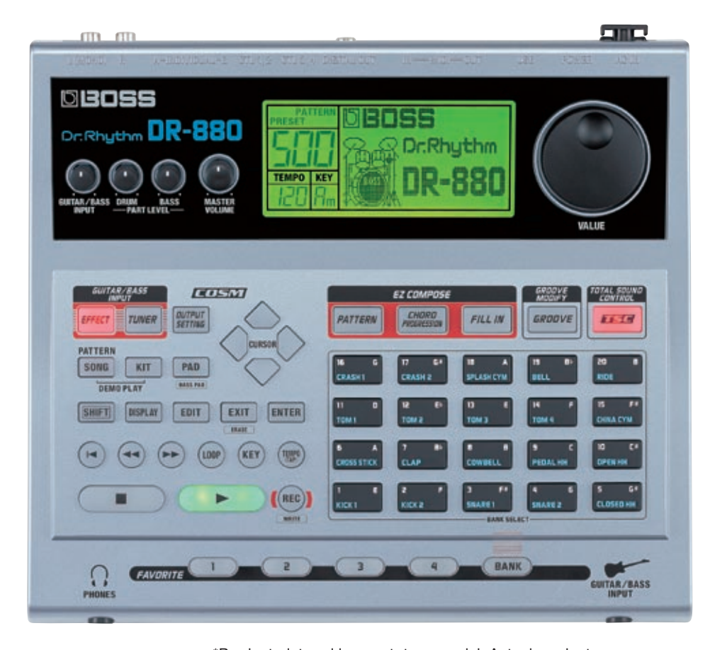
*Product pictured is a prototype model. Actual product appearance may be subject to change.