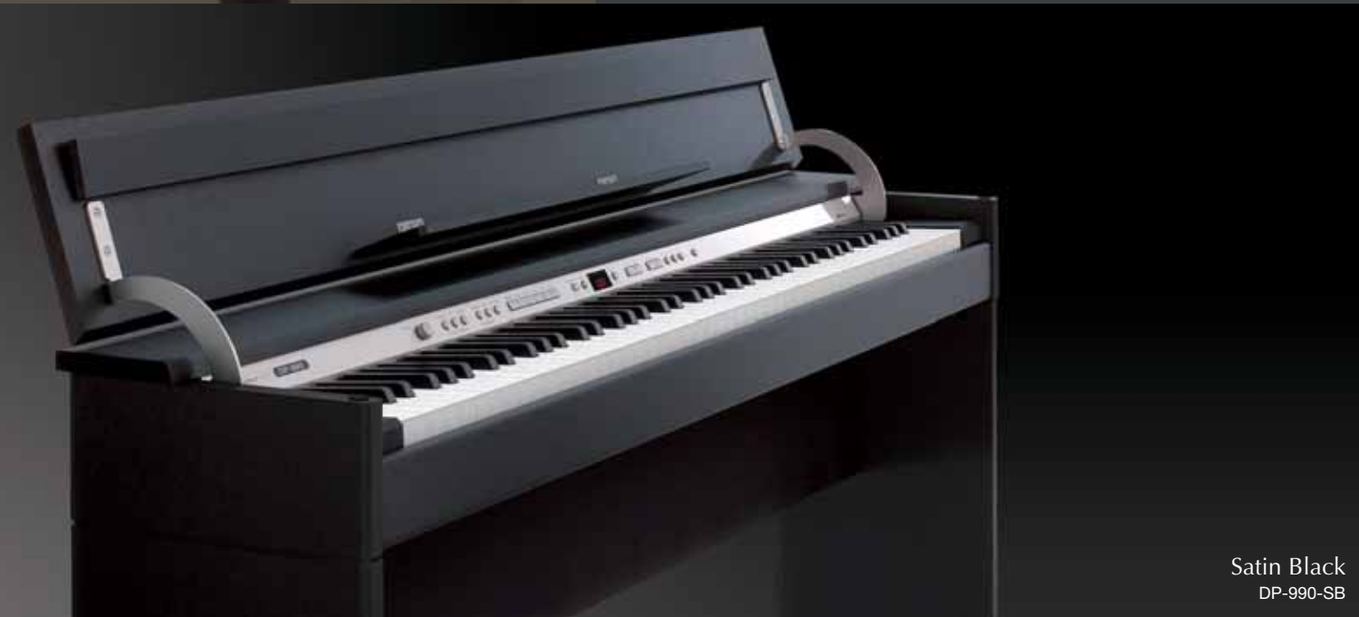
Satin Black DP-990-SB