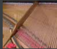
*Photograph is an image.

The DP-990 features a world-class 88-key concert grand sound, with individual multi-samples for every key. It's touch responsive to the subtlest pressure and nuance — from the deepest, most powerful bass to the most delicate high notes. You can even custom tailor your own piano sound by adjusting Damper Resonance, String Resonance, Key-Off Resonance, and other parameters.