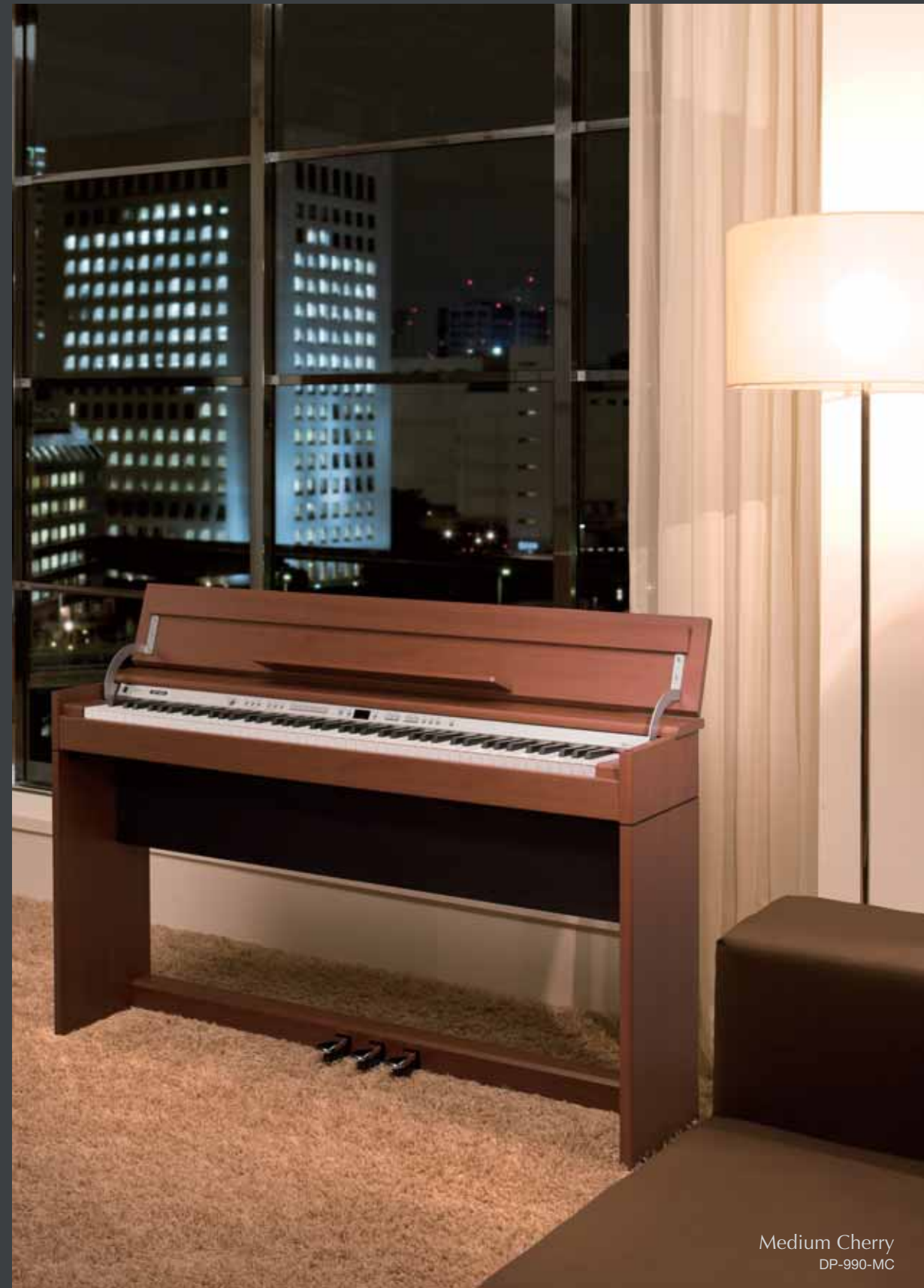
Medium Cherry DP-990-MC