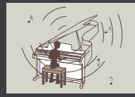
*Illustration is an image.

Roland's amazing 3D Sound Control allows the DP-990 to produce a rich, deep resonant sound that transcends the size of the instrument. The built-in Dynamic Sound Control adds brilliance and zest so the piano can ring clear, even during ensemble playing. The internal sound system, with two high-performance 12 W speakers, delivers the definition and volume required for a high-quality piano sound.