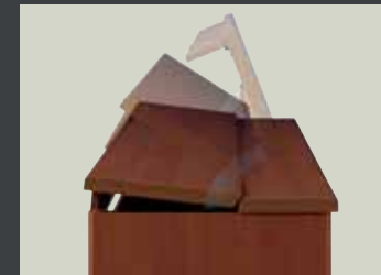
■When lid is closed, a smooth, flat surface is provided.

Compact, stylish, and approx. 30cm (11-13/16") deep, the DP-990 impresses with its sleek, modern-furniture-like design, featuring a solid, soft-close lid that can be used as a music rest when opened and a flat desktop-like surface when closed. The piano is available in two gorgeous finishes: Satin Black (SB) and Medium Cherry (MC). The DP-990's slim-line design makes it easy to transport.