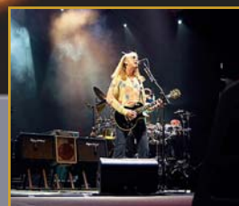
Davey Johnston, Elton John