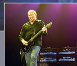
Alex Lifeson, Rush