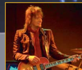
Ritchie Sambora, Bon Jovi