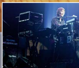
Don Airey, Deep Purple