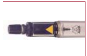
Choice of phantom power supply or internal 9 V battery

AKG Acoustics GmbH Lemböckgasse 21–25, P.O.B. 158, A-1230 Vienna/AUSTRIA Tel: (+43 1) 86 654-0*, Fax: -7516, e-mail: sales@akg.com