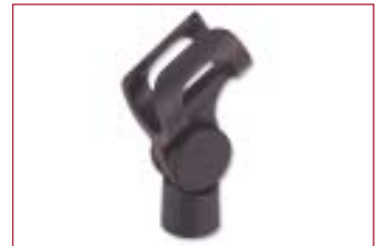
SA 63 stand adapter