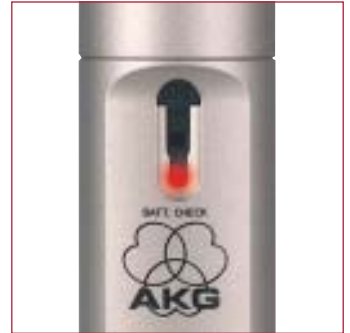
Battery status LED: Battery ok – LED blinks briefly