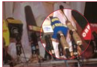
In demanding live sound or recording applications, the C 1000 S is as flexible and dependable as a Swiss army knife.

The red LED above the microphone switch stays illuminated when the remaining battery life falls below 45 minutes. When the mic is turned on, the LED blinks briefly to indicate that a usable battery is correctly inserted. The LED does not function when phantom power is used.