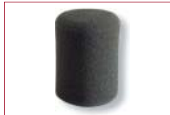
W 1000 windscreen

The red LED above the microphone switch stays illuminated when the remaining battery life falls below 45 minutes. When the mic is turned on, the LED blinks briefly to indicate that a usable battery is correctly inserted. The LED does not function when phantom power is used.