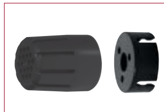
Polar Pattern Converter (left) and Presence Boost Adapter (right)