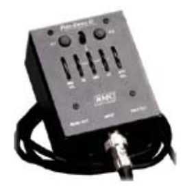
RMC Polydrive II

The Breedlove Synergy System delivers astoundingly warm and authentic acoustic tone, but that's just the beginning. Imagine being able to connect your acoustic guitar directly to a Roland modeling system like the VG-88. Imagine hooking your electric directly to your MacBook® or PC laptop, and recording MIDI information in real-time. Imagine six individual saddle sensors sending six separate channels of information via hexaphonic output, giving you complete control over the tone and pitch of each individual string!