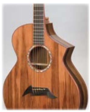
A12 Custom with Synergy System Installed

The Breedlove Synergy System delivers astoundingly warm and authentic acoustic tone, but that's just the beginning. Imagine being able to connect your acoustic guitar directly to a Roland modeling system like the VG-88. Imagine hooking your electric directly to your MacBook® or PC laptop, and recording MIDI information in real-time. Imagine six individual saddle sensors sending six separate channels of information via hexaphonic output, giving you complete control over the tone and pitch of each individual string!