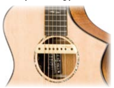
M1 Magnetic Soundhole Pickup

Onboard controls for gain, low frequency cut and midrange cut allow for fine adjustment of the magnetic pickup tone, and a separate midrange cut control is provided for the Element undersaddle pickup.