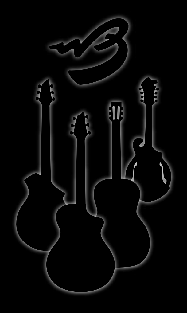
Breedlove Owner's Manual