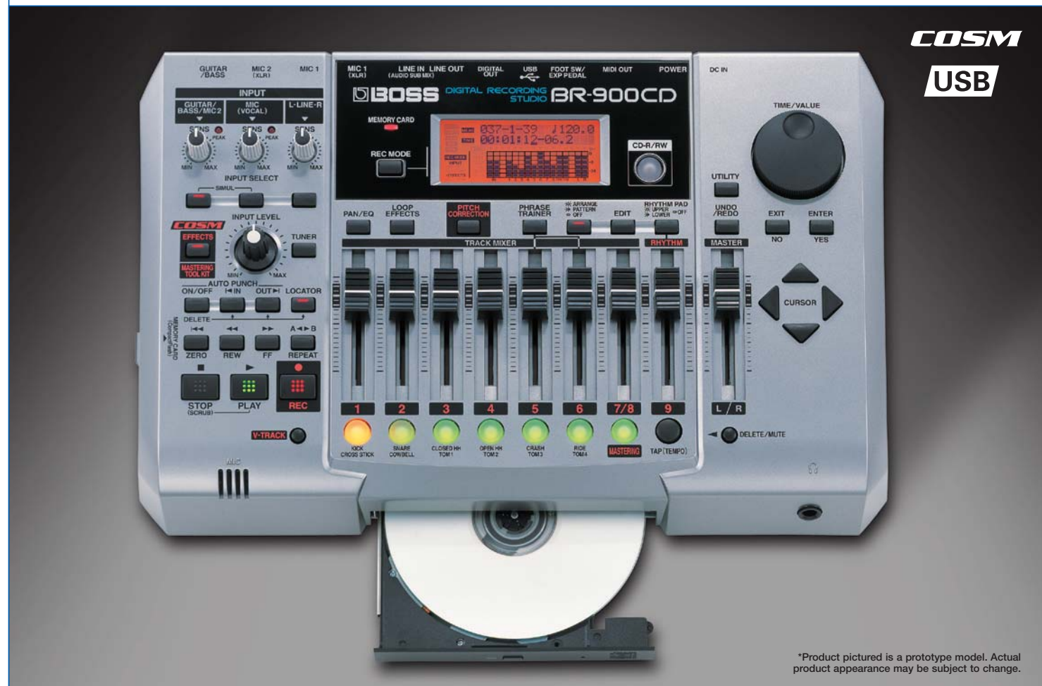
*Product pictured is a prototype model. Actual product appearance may be subject to change.

The BR-900CD the musician's portable dream studio. It's road tough, fun to use, and it performs far beyond its weight class. This reliable all-in-one digital recorder stands out with its professional effects, realistic drum-pattern generator, vocal-correction and Mastering Tool Kit, digital output, and internal CD burner. No matter where you are — in your home studio or on the road — all you'll need is a BR-900CD, and you can write, record, edit, mix, master, and burn a complete polished CD anywhere, anytime.