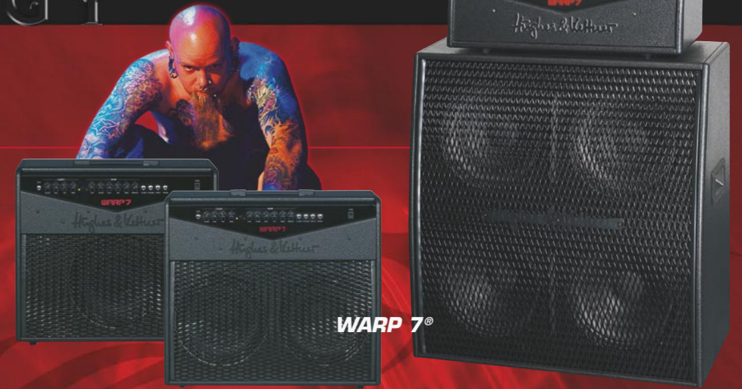
Dark, dank and deadly

The WARP 7™ pounces and pummels you. Just the thing for seven-stringers or detuned guitars. With the now legendary Warp sound and an amazing Clean channel. Easy to move from gig to gig, and easy to operate without an engineering degree. Big, bold 100-watt power amp and a 12" Celestion® speaker custom-fitted to its violent voice. The WARP 7™/212 combo in fact has two of them—