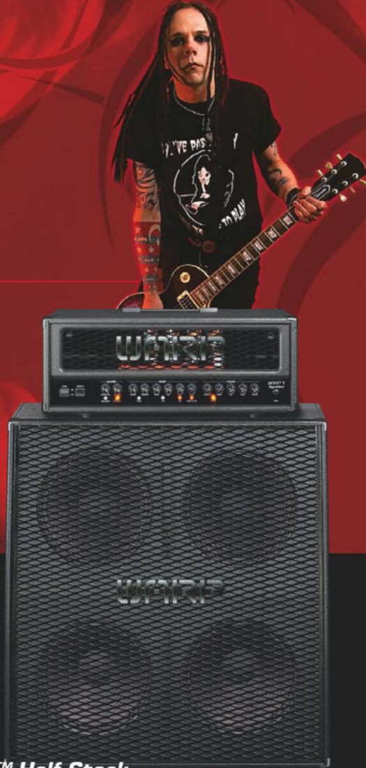
WARP T™ Half Stack

Gear up for the 21st century—Get Warped!