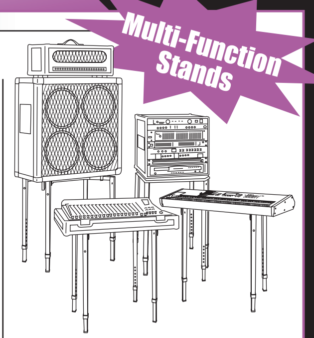
One stand is all you need for ALL of your home recording and studio project needs!

Unique spider frame design adjusts the width and depth to allow for max support.