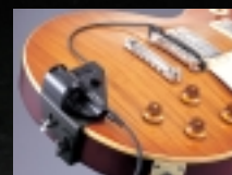
GK-2A Divided Pickup

The Roland 13-pin GK Pickup allows each guitar string to be output as a separate signal, permitting effects processing possibilities far beyond conventional guitar pickups. Installing the GK-2A Divided Pickup is simple and totally reversible, but the effect you have on your listeners will be permanent.