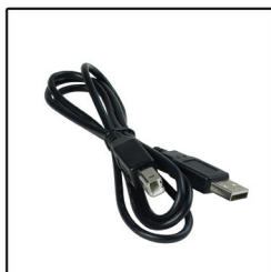
6 FT USB CABLE