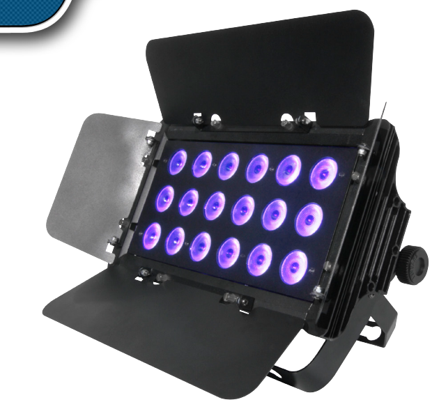
Weight: 7.4lbs (3.4kg) Size: 15.3 x 7.7 x 7.4in (389 x 197 x 187mm)