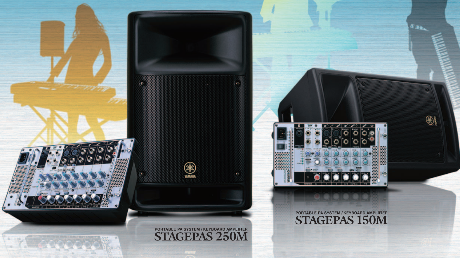
PORTABLE PA SYSTEM / KEYBOARD AMPLIFIER STAGEPAS 250M