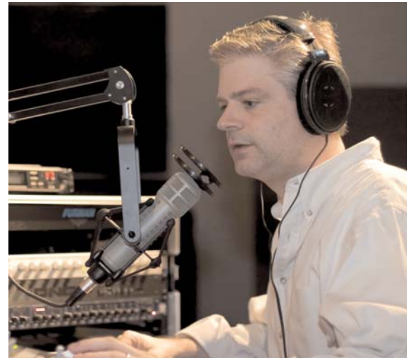
With the Marantz Professional PMD670 files can be transferred to a PC and used in the studio.