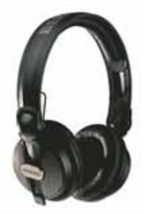
available 2nd quarter 2004

Be it in the DJ booth or in the lazy chair at home, the HPX4000 DJ headphones display impressive sound separation that is a must nowadays. Incredibly comfortable to wear, there is no better way to include your ears.