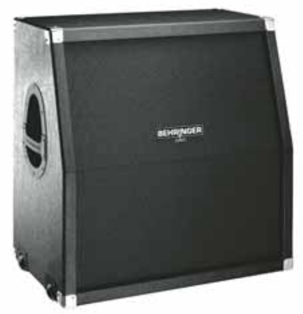
available 3rd quarter 2004

BG412V We have armed this powerful 4 x 12" 200-Watt guitar stack with original BUGERA™ speakers producing authentic tone reproduction with loads of spare headroom. Depending on what kind of sound you fancy, choose the GMX1200H analog modeling head, the LX1200H digital modeling head or any other amp of your choice. Either way, satisfaction is guaranteed.