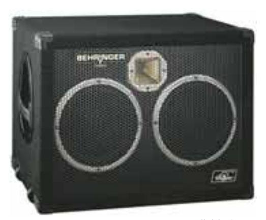
available 3rd quarter 2004

High-Performance 600-Watt Bass Cabinet with 2 x 10" BUGERA ^{\!\scriptscriptstyle TM} Speakers and 1" Horn Driver