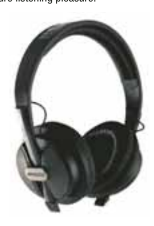
available 2nd quarter 2004

Today's professional studio users demand a superb frequency response from their headphones. It is in the studio environment where a set of headphones will either make it or break it. The HPS5000 studio headphones were custom designed to meet and exceed the expectations of ambitious audiophiles, bringing out pure listening pleasure.