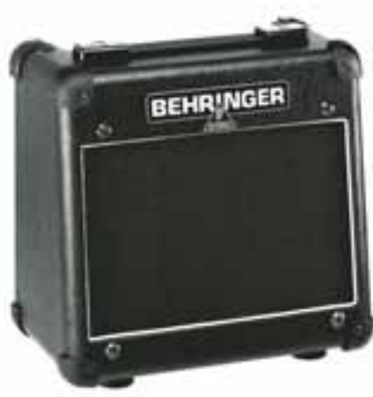
available 3rd quarter 2004

If you want to start learning how to play guitar without investing a lot of money, the VINTAGER AC108 is your amp. Offering much more than just bare bones, it boasts a 15-Watt amp section with a hand-selected vacuum tube feeding a 20-Watt 8" vintage-tuned guitar speaker. Despite its compact size, it produces an abundance of power with the classic tube sound.