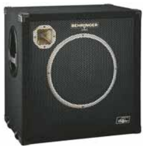
available 3rd quarter 2004