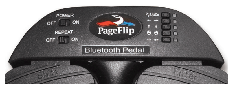
Figure 4: Top view of PageFlip Cicada control panel.