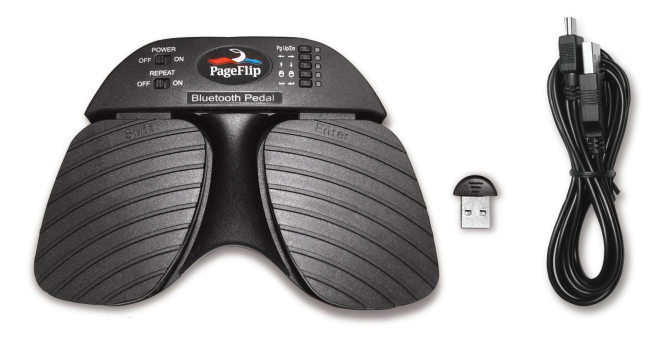
Figure 1: Package contents: PageFlip Cicada, Bluetooth USB micro adapter, and USB power cable.