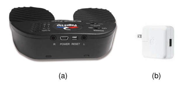
Figure 3: (a) Rear view of PageFlip Cicada. Attach the mini-USB end of the 6' USB power cable into the rear POWER outlet and connect the other end into (b) any USB AC adapter, such as those found on iPads and iPhones.

In addition to being battery-operated, PageFlip Cicada may also be plugged into the wall via a USB AC adapter. For added versatility, the pedal may be powered by connecting it directly to the USB port of a computer. A USB power cable (Fig. 1) is included for use with any USB AC adapter, such as those included with iPads and iPhones (Fig. 3(b)). Simply plug one end of the power cable into the mini-USB outlet on the rear of the PageFlip Cicada (Fig. 3(a)) and plug the other end into the USB AC adapter.