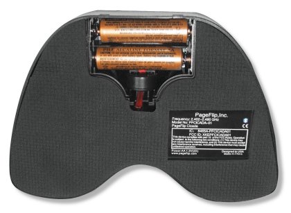
Figure 2: Battery cover is located at the bottom of the PageFlip Cicada. A convenient storage compartment for the Bluetooth dongle lies alongside the batteries.

Note: To conserve battery power, turn off device when not in use. The unit automatically turns off after two hours of inactivity, but can awake instantly upon a pedal tap.