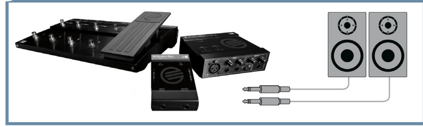
GUITAR RIG KONTROL/MOBILE/SESSION with active speakers.