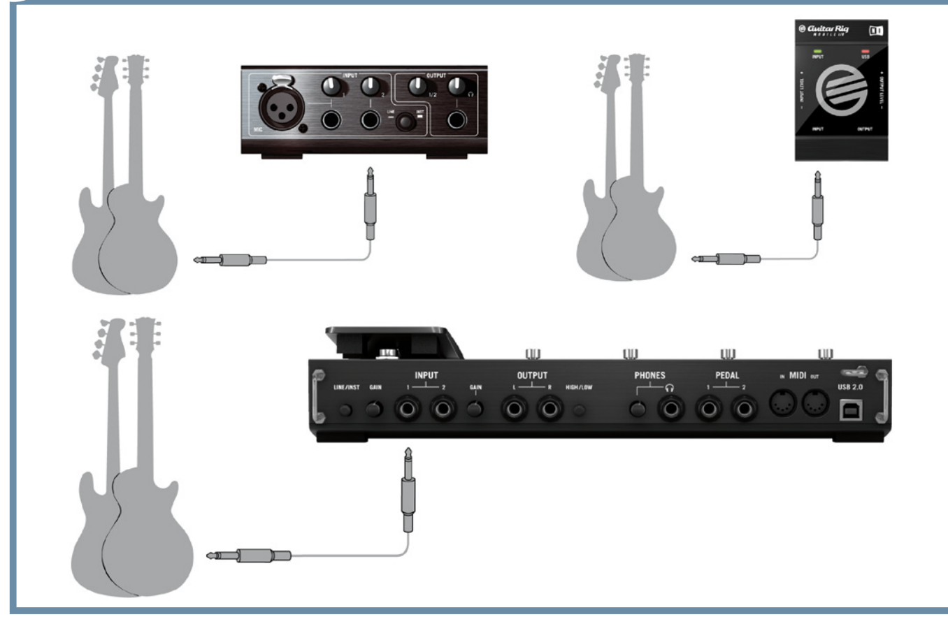
GUITAR RIG SESSION/MOBILE/KONTROL with guitar or bass.

With the volume turned down on your monitoring system or your headphones off, plug your instrument cable into the input socket of the audio interface.