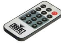
Wireless IR remote