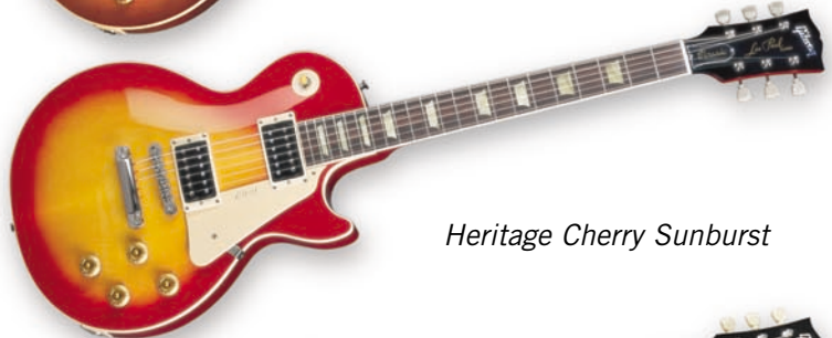
Heritage Cherry Sunburst