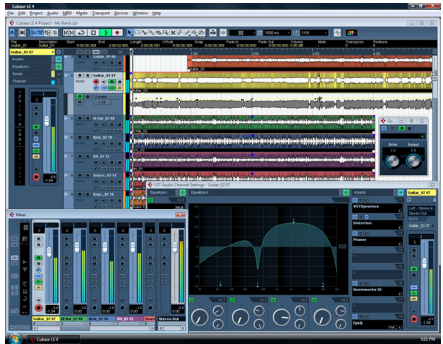
Cubase LE 4

The powerful software Mixer lets you easily route signal paths and apply real-time dynamics (compressor, limiter, gate) and EQ adjustments. The Ionix software suite also includes the new Pantheon II reverb plug-in from Lexicon and Toontrack's EZ Drummer Lite. And it all works together seamlessly in Cubase LE 4 (also included).