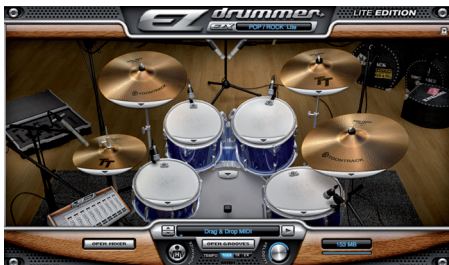
Toontrack EZ Drummer Lite