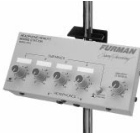
HR-6 Personal Headphone Mixer

The HR-6 is a compact six-channel, five-pot remote mixer that clamps to any mic stand. When used with the HDS-6, the HR-6 allows musicians to customize their own headphone or monitor mix, and the engineer doesn't have to touch the board.