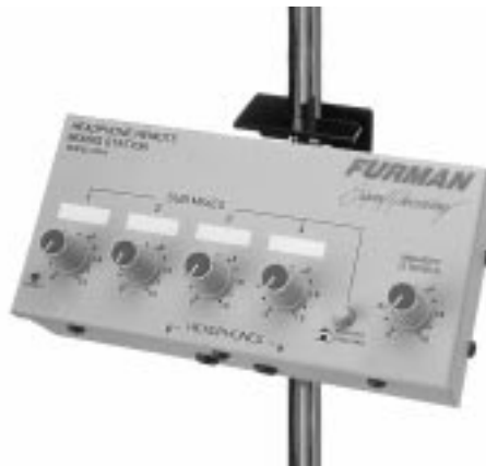
HR-6 Personal Headphone Mixer

The HR-6 is a compact six-channel, five-pot remote mixer that clamps to any mic stand. When used with the HDS-6, the HR-6 allows musicians to customize their own headphone or monitor mix, and the engineer doesn't have to touch the board.