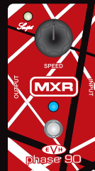
PSEUDO LESLIE Set Speed knob to 12:00, Script switch in (Script logo mode)