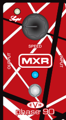
CLASSIC EVH Speed knob to 9:00, Script switch in (Script logo mode)