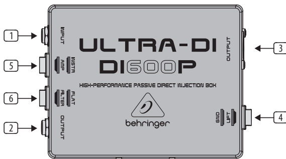
Fig. 1: Top view