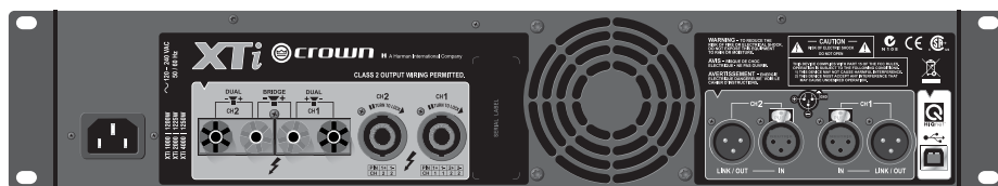
XTi 1000, 2000, 4000 back panel