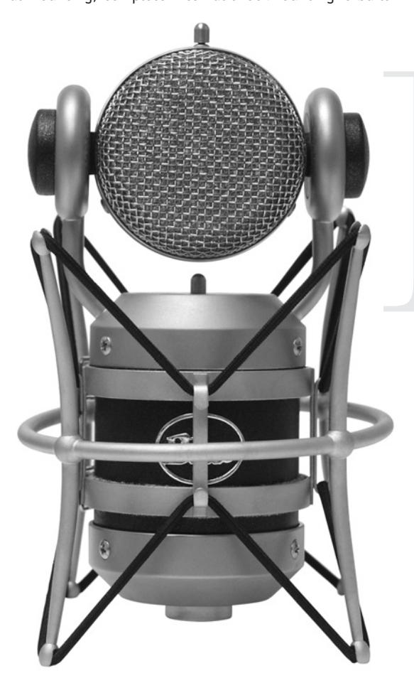
Mouse with The Shock

The mouse comes with its own custom-built shockmout, The Shock , as an included accessory. Along with this external mounting, complete internal shockmounting is built