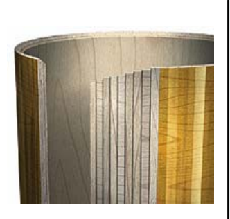
Force CLTF shells 9-ply high gloss lacquer Full maple shells made with the CLTF method

offers Sonor sound quality at an unbeatable price available in preconfigured Setups Each of the three Force series offers excellent sound performance for a wide range of musical styles. Innovations in sound and technology are continuously incorporated into the further development of the Force concept.