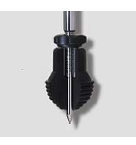
Bass Drum Spur Rubber Force bass drum spurs can be converted from rubber to metal to give perfect hold on any type of floor.