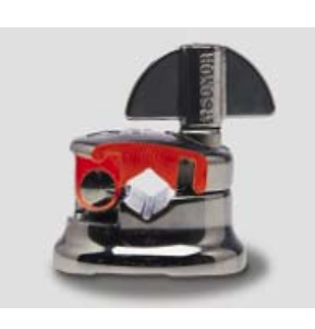
Force Prism Mounting System Sonor has developed the principle of prism clamps for drum making. It gives a maximum of reliability and stability by using a minimum of power. This greatly eases setup of any drum set.