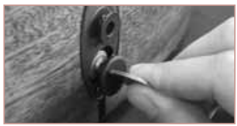
Replacing the battery. With a coin or guitar pick, push in and rotate counterclockwise 1/8-turn until you hear a click. The above photo indicates how far you should expect to turn.

Yaylor Expression System (ES) — a groundbreaking concept in acoustic guitar amplification (500 series and up). It combines a state-of-the-art pickup system with a "professional audio"-quality pre-amp. Taylor Guitars developed proprietary sensing technology for the ES, utilizing the guitar's entire soundboard to create a network of magnetic surface sensing microphones. The advanced design is seamlessly integrated into your guitar, allowing for total control in the form of three unobtrusive side-mounted knobs. Your guitar's natural tone will sing loud, clear, and true.