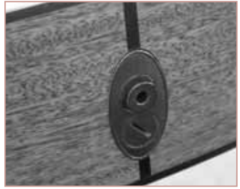
Taylor Expression System battery compartment in the position to remove the battery.