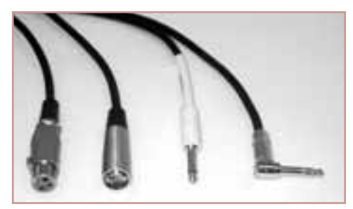
L-R: XLR (female), XLR (male), standard unbalanced cord (straight), TRS (right angle).